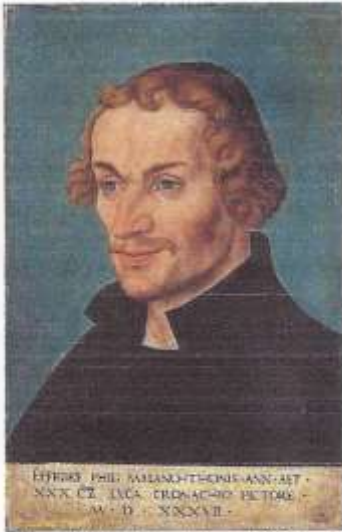
Portrait of Philip Melanchthon, 1537, by Lucas Cranach the Elder. Oil on panel

Introductory Mini-Slide-Presentation and Lecture about young Luther and his Contemporaries, Wittenberg then and today, Castle Church and Luther's close Friend and Collaborator Philipp Melanchton, a recognized Scholar and Professor at the Wittenberg University and his enormous influence/contributions to the cause of the Reformation. Portrait by Lucas Cranach the Elder. Oil on Panel, 1537