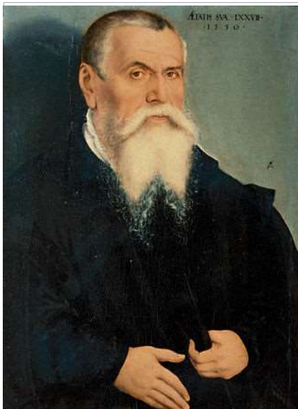
Portrait by his son, Lucas Cranach, the Younger

A close friend of Martin Luther, was not only one of the most accomplished and prolific painters of the 16 th century, he was also the Mayor of Wittenberg and owned a pharmacists shop that is still in business today as pharmacy (or Apotheke) in Wittenberg. He painted many of the well known Dignitaries of the Reformation as well as religious Figures and with it, advanced the Reformation, and became an important promoter of the Reformation Movement. He was supported by the Electors of Saxony.