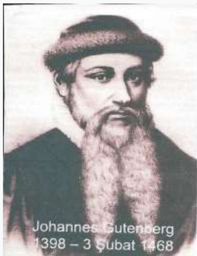
Johannes Gutenberg 1398 – 3 Subat 1468