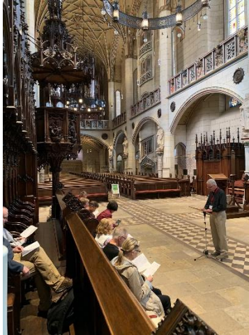
Pastor leading devotions in the Castle Church