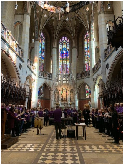
The Gospel choir of the Castle Church participated in our Saturday worship. Over 100 attended!